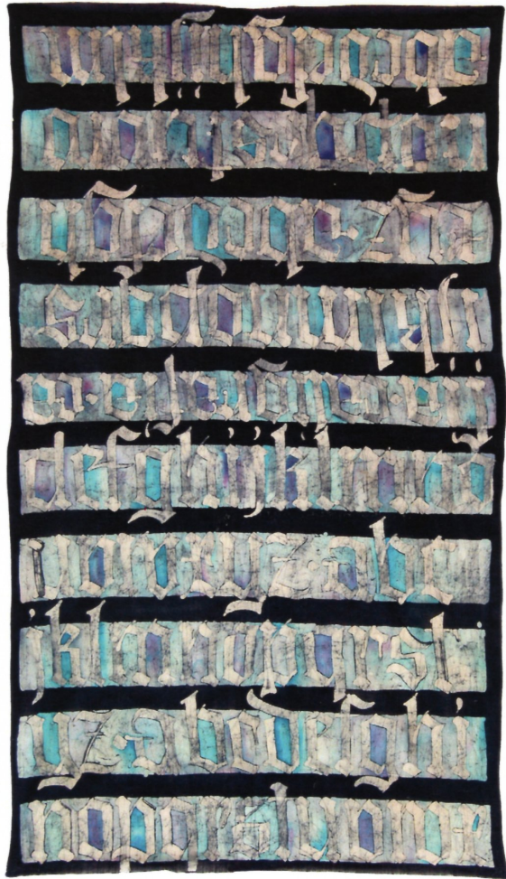
--Marina Soria, "Thread is Language"

Feb 26 Program "Text and Textile" will explore the overlaps between the art of calligraphy and the art of weaving. We will especially focus on five contemporary textile artists who have incorporated lettering into their pieces.